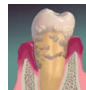
Advanced Periodontal Disease (Periodontitis)

Now there is a new procedure called Perioscopy, featuring miniaturized digital video technology that enables your clinician to diagnose and treat areas below the gumline without the discomfort and inconvenience of surgery.